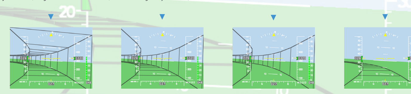
Different visual representations of the same flight trajectory in a Highway-in-the-Sky display

We have developed a haptic-shared control architecture that uses the generic PAV model, such that we can provide haptic guidance forces to PAV 'pilots' performing a closed-loop control task. A Highway-in-the-Sky display provides visual cues concerning the trajectory that needs to be followed. We are currently evaluating this system to assess whether PAV 'pilots' can use these different cues and if this approach leads to increasing flight performance.